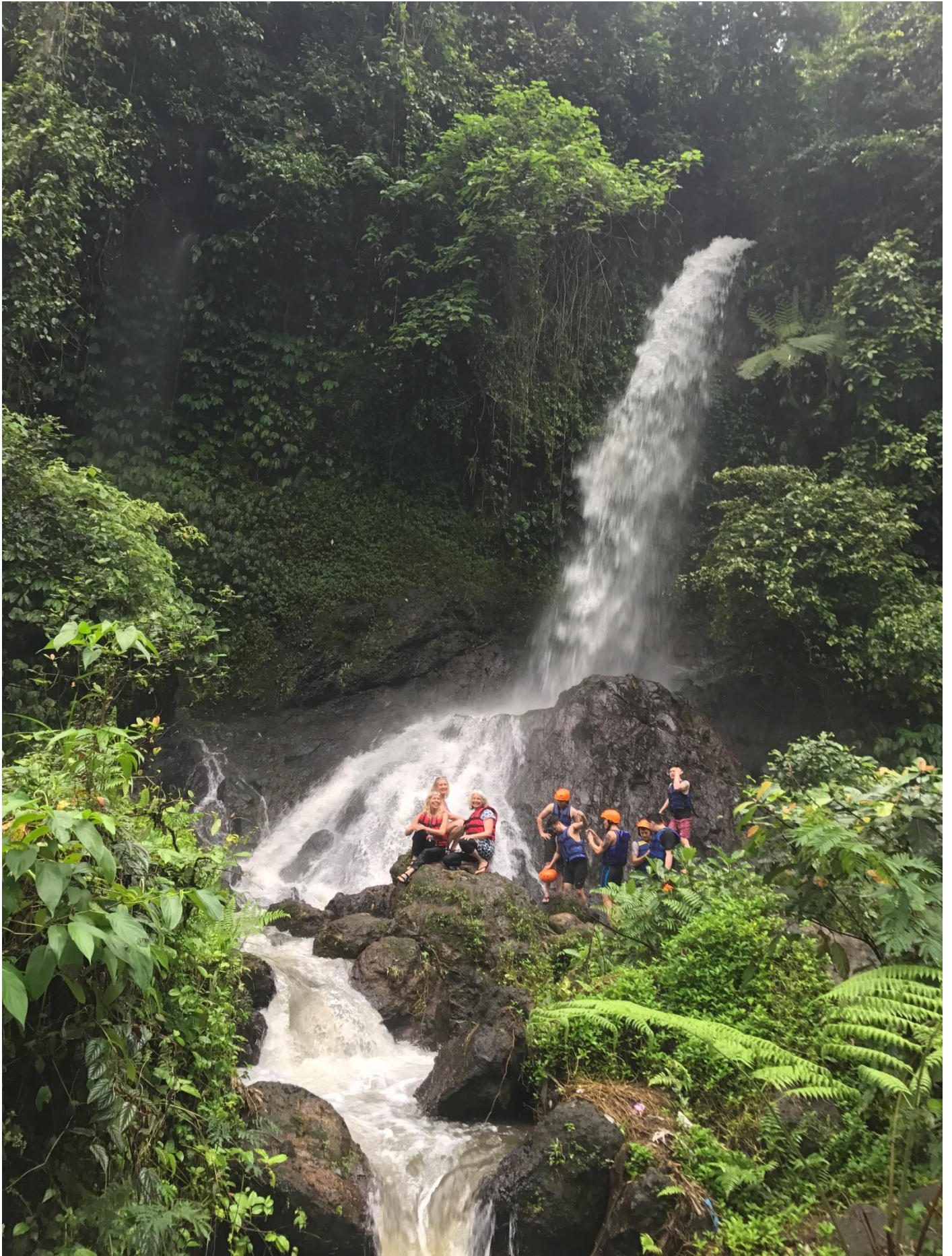
White water rafting on the Telawaja River is a spectacular experience – and the water is warm!